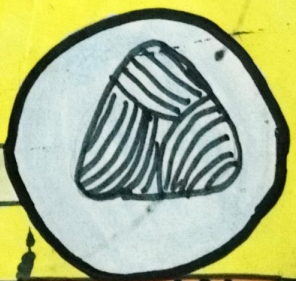
WALL PURITY MARK