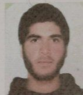
Photograph of the bearer

BACHELOR OF SCIENCE IN SERICULTURE (HONS.)