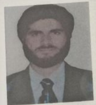
Photograph of the bearer

DOCTOR OF PHILOSOPHY Environmental Science