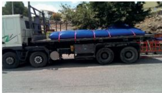
Fig. E.3 FLEXIBLE TANK STRAPPED ON A FLAT-BED TRUCK

The filling bag inside of a flexible tank is typically intended for single use and should be capable of uninterrupted ADWS provision for one month or more. At the end of a particular event, the bag is replaced by a new bag or drained and decommissioned for use in subsequent crises. Figure E.3 illustrates such a flexible tank, strapped to a flat-bed truck. A flexible tank's filling bag should be capable of easy replacement.