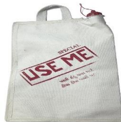
Fig. E.2 PERSONAL WATER BAG