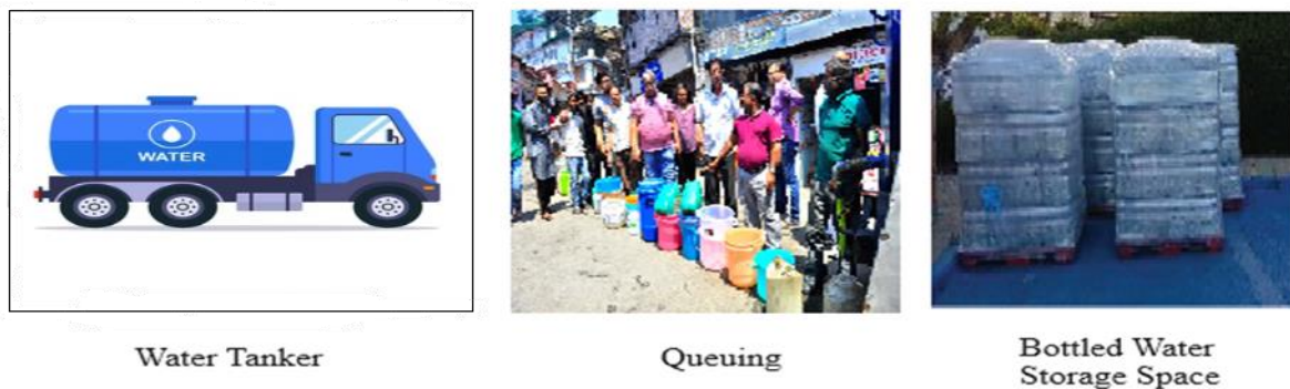
Fig. D.2 COMPONENTS OF A TPD CLOSE TO USERS' NORMAL POINT OF DELIVERY

Figure D.2 illustrates the basic components where users receive ADWS provision through static tanks or mobile bowsers/water ATM/ Water kiosks close to their normal point of distribution (at the roadside close to their homes or workplaces). The example TPD in figure D.2 would typically be manned continuously as it is more likely to be visited periodically to ensure its condition and serviceability remain satisfactory and to replenish its static assets' contents.