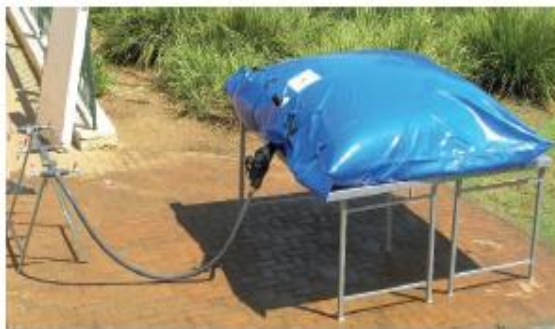
Fig. E.1 Flexible Tank

Flexible tanks consist of an exterior cover (resistant to UV radiation) and a filling bag. A flexible tank's multi-drinking water taps should be sized to match the entrance size of any containerized water assets (such as personal bags) the ADWS has been designed to integrate with. Flexible tanks typically include an air-inlet valve and can include a pressure relief valve. The shelf-life of a flexible tank is typically moderately long (5 years or more). Figure E.1 illustrates an example of a flexible tank. It can be stored in folded form and inflated with an air pump when it is to be used as a tank. It can be placed on a flat stand to serve as a water well without pumping.