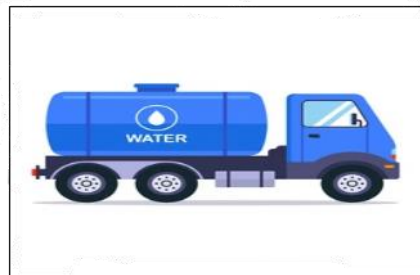
Fig. E.4 Mobile Tanker

Mobile water tankers can take many forms, sizes and means of transportation. The tank linings, fittings and accessories should be suitable for contact with drinking water and capable of complete and repeated disinfection over their working lives. See examples of mobile tankers in figure E.4.