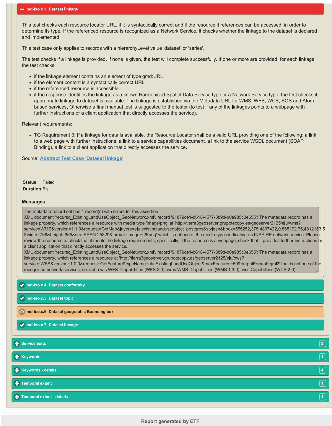
Figure E.2 — Test report created by the INSPIRE Reference Validator on a metadata record