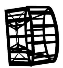
FIG. 1 CAGE WHEEL