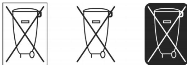
Figure A.4 – The symbols for collection of batteries