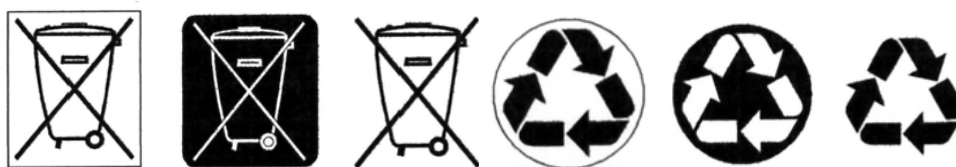
Figure A.5 – The symbols for collection and recycling of batteries

The symbols shown in Figure A.5 are listed in Annex 1 of this law.