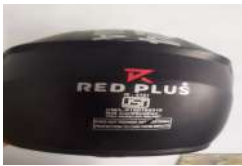
IMG_20240412_154910.jpg 3 MB

Sir i am purchase a bajaj bike from samalkha bajaj showroom they give me one halmet but this halmet not a original isi mark. I am check this isi no. In BIS Application. But this is not verify isi no. So i am complaint for this halmet company.