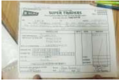
IMG_20240416_162601.jpg 5 MB