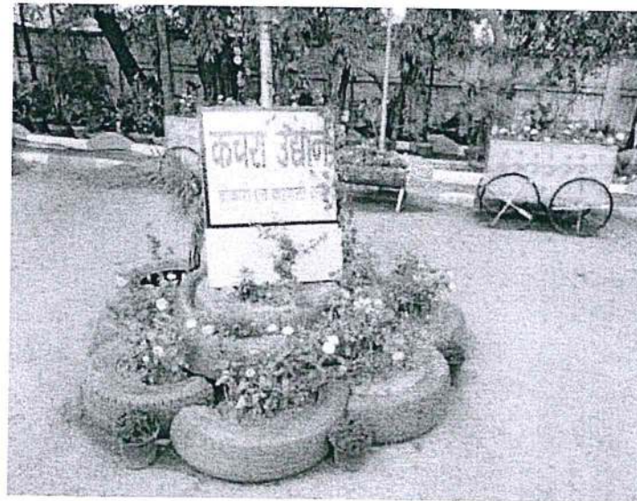
It was named 'Kachra Udyan'

In the month of April 2022, a small initiative, was taken to use the waste, scrap and disposed items from mines of B&K Area, in developing Garden at Guest House, Kargali.