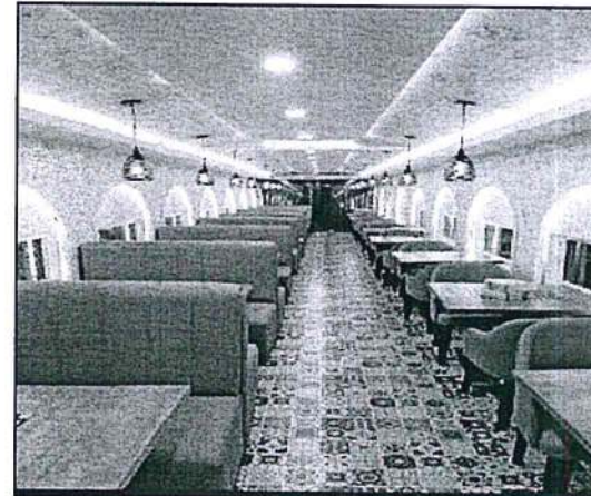
Rail coach restaurant Guntur Railway Station, Ministry of Railways