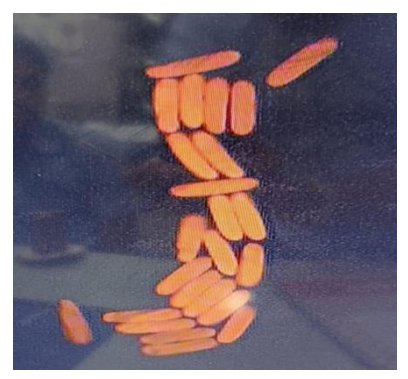
Slit cross section