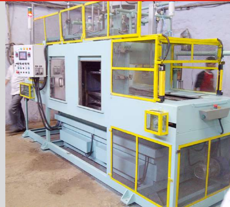
▲ Factory Automation