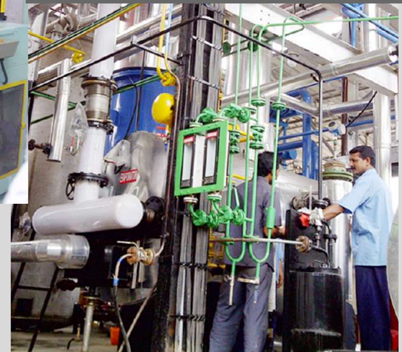
Process Automation ►